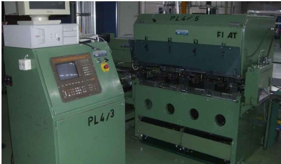
Pivat P33 1986